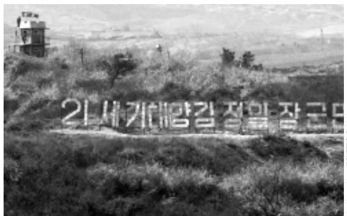
A sign praising North Korean leader Kim Jong-Il stands near an army observation post at the DMZ.

oratory to study nature's self-reclamation. For the Koreas, it offers the last opportunity to re-establish biodiversity in their lands. Both nations have largely been indifferent to their ecosystems, extirpating many species that persist in the DMZ. Though experts have not had access to the DMZ proper, they have found enough evidence to estimate that the DMZ and the partially pro-