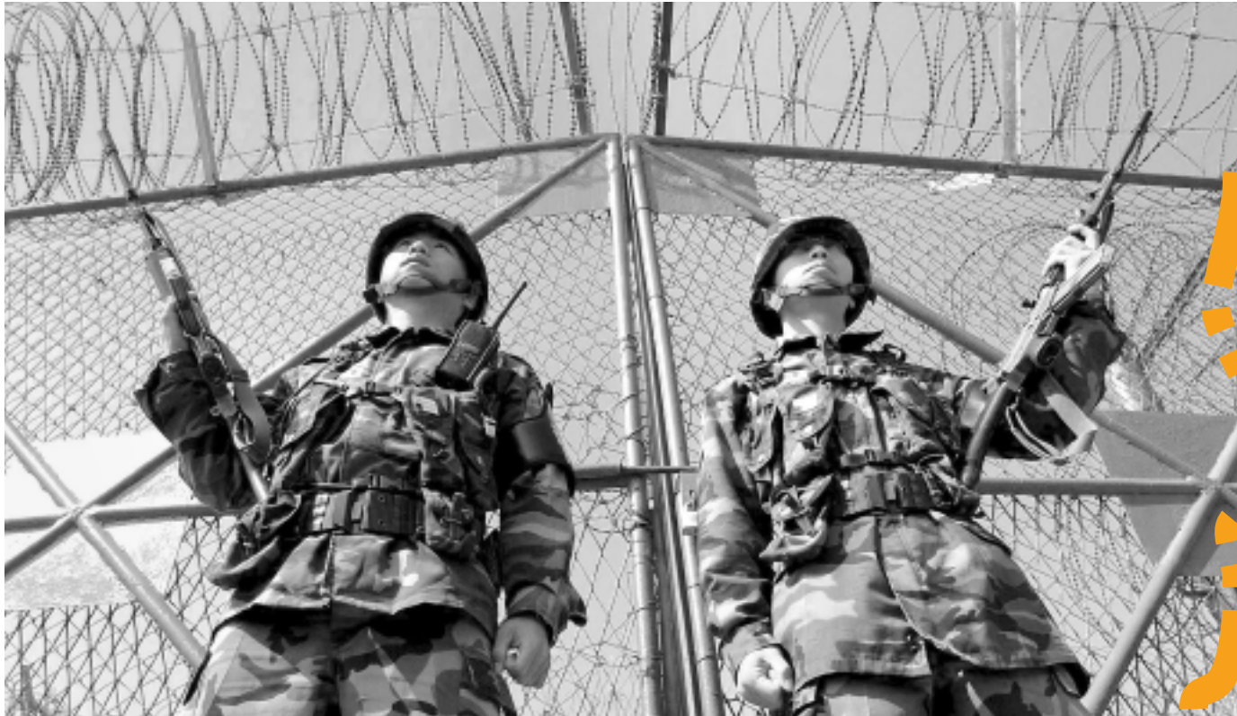
South Korean soldiers stand guard at a gate to the DMZ in Paju, north of Seoul.