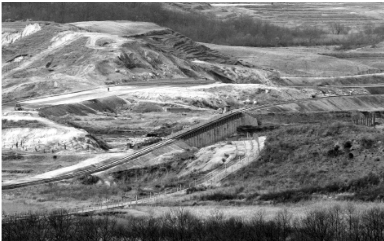
A North Korean soldier stands guard at the construction site for a new road and railway.