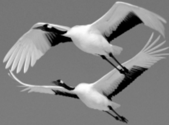
Red-crowned cranes are sacred to Koreans North and South.