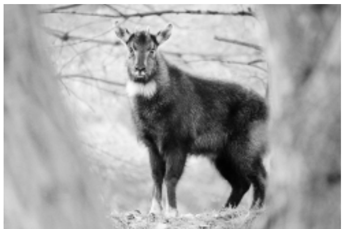
The endangered Amur goral, a type of goat-antelope. The animals’ main threat is humans, who prize the meat and make medicines from the organs.