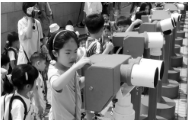
Pay per view: South Korean kids on a field trip to the DMZ line up to see North Korea through binoculars.

Moreover, it is equally important environmentally. Excluding humans from the DMZ has allowed an unexpected and extraordinary experiment with nature to unfold. In this four-kilometer-wide corridor, stretching 250 kilometers across the peninsula, wild habitats have luxuriantly rebounded from war’s destruction. The fallow land on the western section has reverted to thick prairie and shrubs. Rich green forests adorn the eastern mountain ranges. Endangered and rare plant and animal species have found homes